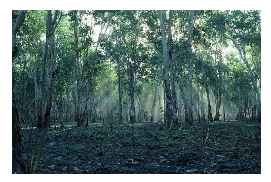
Melaleuca viridiflora swamp is widespread throughout the Arafura Swamp